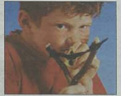
Discipline from parents and teachers is what's missing.

the teachers to send students to the principal to determine punishment according to their behaviour.